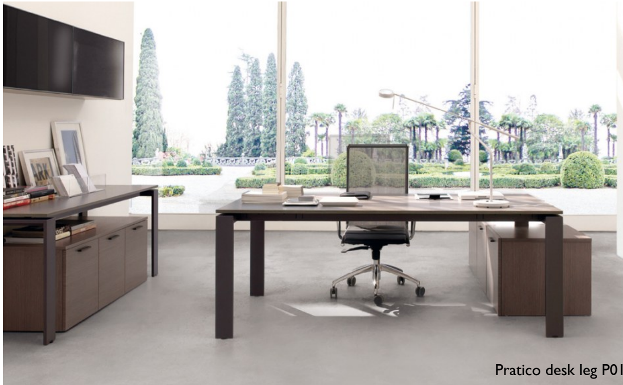
Pratico desk leg P01