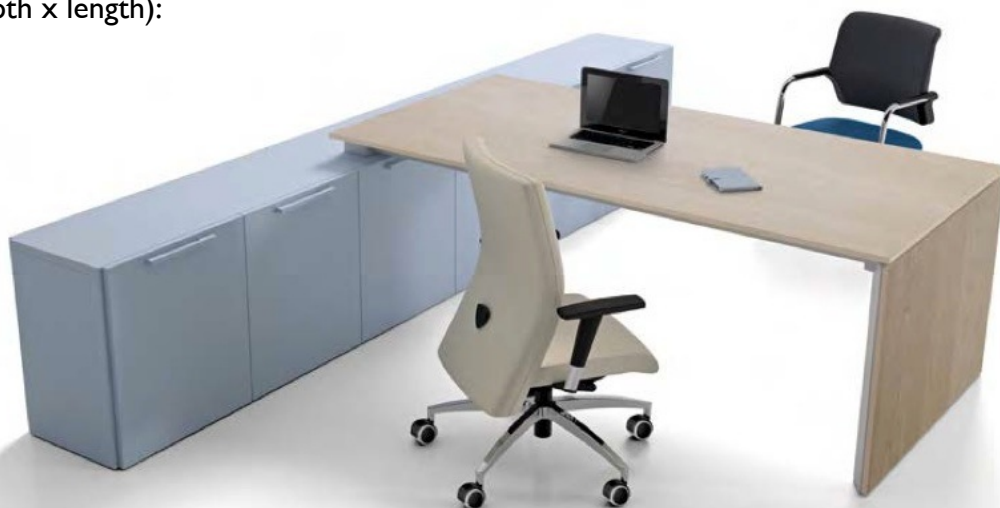
Pratico desk leg P03

60x80cm (23.6"x31.5") 60x100cm (23.6"x39.4") 60x120cm (23.6"x47.2")