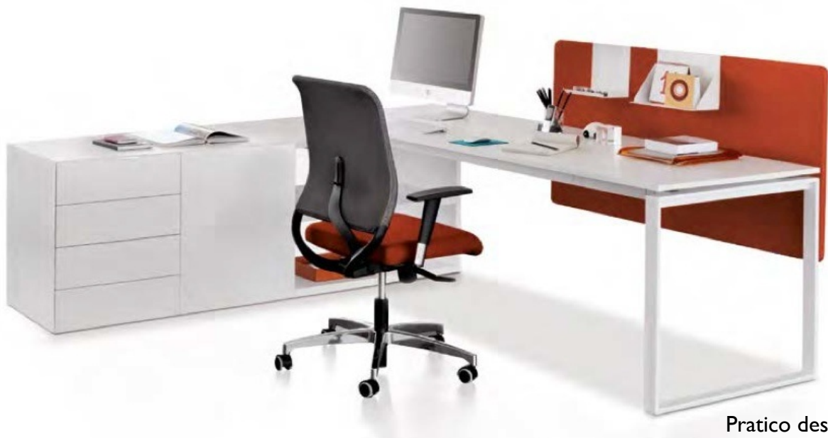
Pratico desk leg P02

Functional, durable and sleek, the Pratico desk system can be combined with various storage solutions. The modularity of the components makes designing the right solution for your space an easy task.